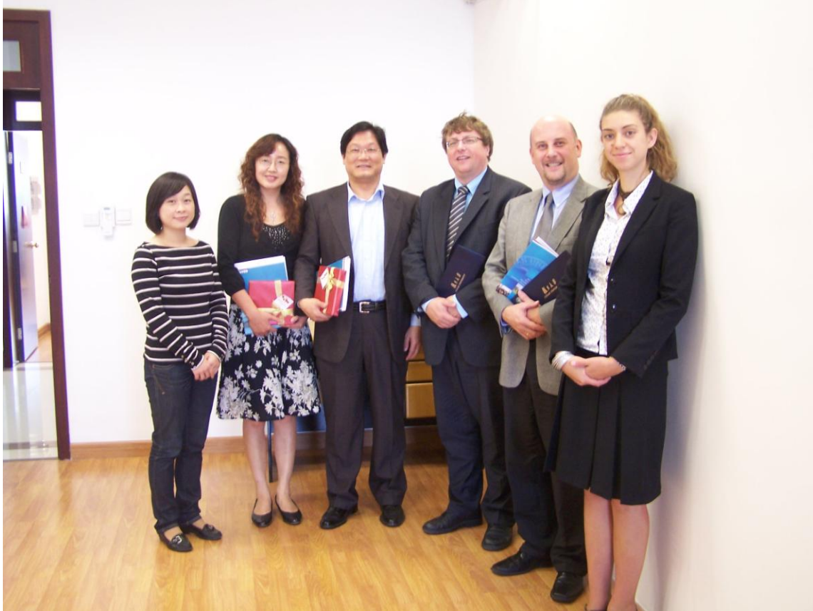
On Saturday 24 and Sunday 25 October, K.U.Leuven participated in the China Education Expo in Shanghai.